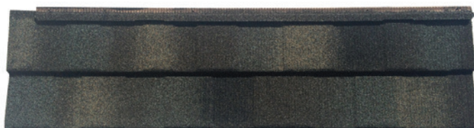
Shingle XD ® Classic Cobblestone