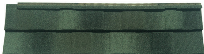
Shingle XD ® Woodland Green