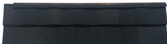
Shingle XD ® Midnight Eclipse