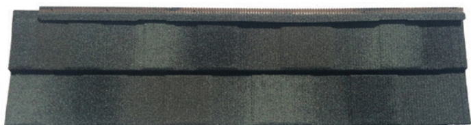
Shingle XD ® Natural Slate